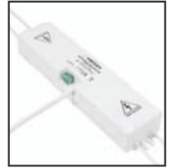
6 262x60x38 mm 1,2 kg