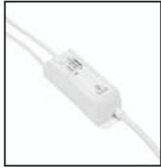
1 106x33x32 mm 0,3 kg