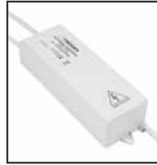
5 184x60x46 mm 1,2 kg