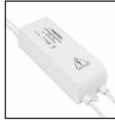
4 163x59x46 mm 1,1 kg