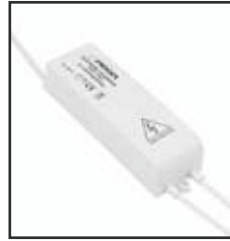
3 150x48x35 mm 0,6 kg