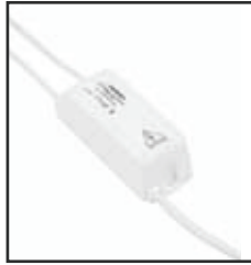
2 114x44x35 mm 0,4 kg